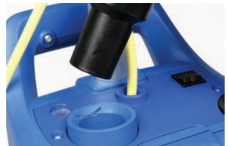
Hose removes for quick clog checks.