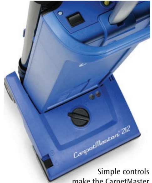
Simple controls make the CarpetMaster easy to operate and maneuver. Convenient handle location assists operator with lifting up stairs, onto carts and more.