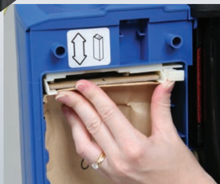
Quick and simple bag replacement. Just lower the bag holder and pull your used bag out, then slide in a new bag and snap holder back into place. Easy as 1-2-3!