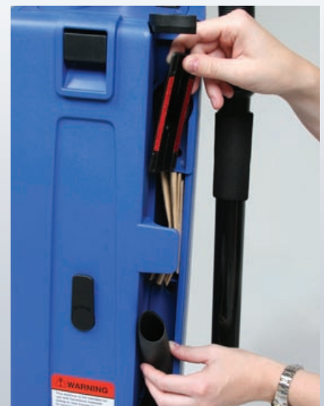
Tool and storage compartment is located directly behind the quick-draw wand.