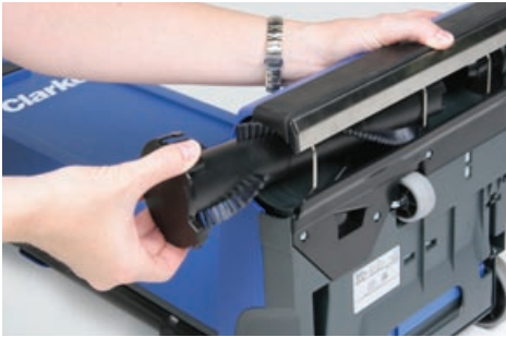
Easy to change brush. Simply unlock the brush and pull out.