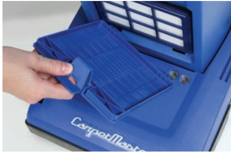
Convenient access to standard HEPA filter.