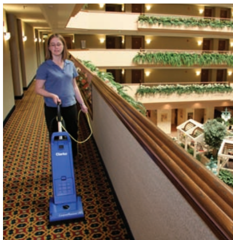
Light handle weight won't fatigue the operator.